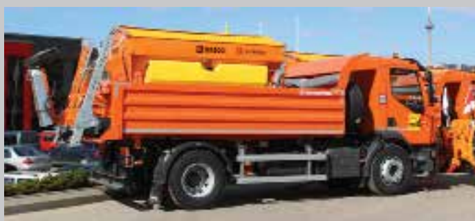
Mounting on dump box

SOLID spreaders can be mounted on almost any vehicle intended for winter maintenance. With easy mounting onto vehicles, there are also a variety of mounting options for the SOLID spreader: