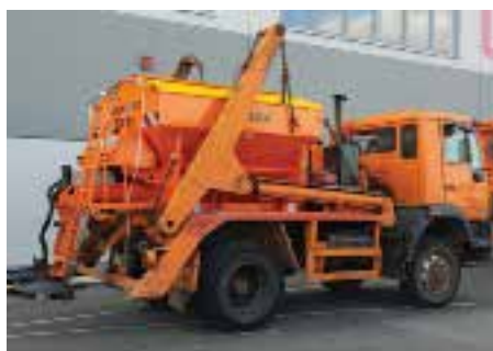
Mounting on vehicles equipped with a container lifter