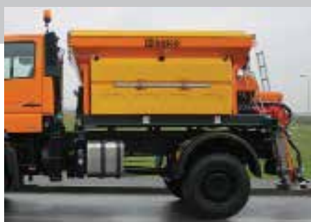
Mounting on dump box balls