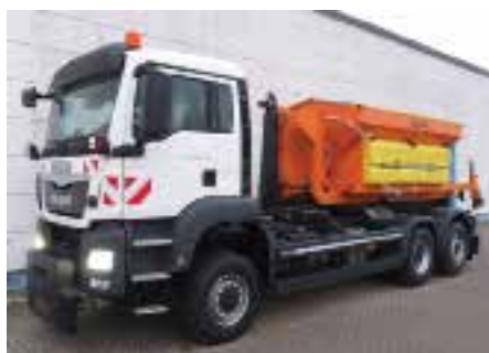
Mounting on vehicles equipped with a hooklift system