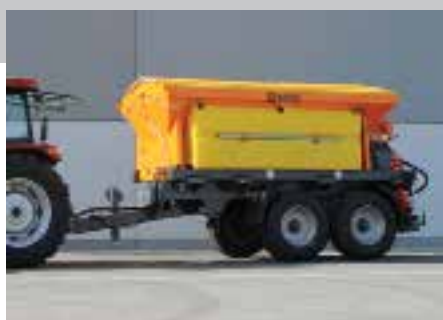
Mounting on trailers