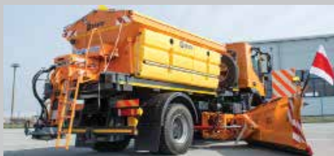
Mounting directly on vehicle chassis